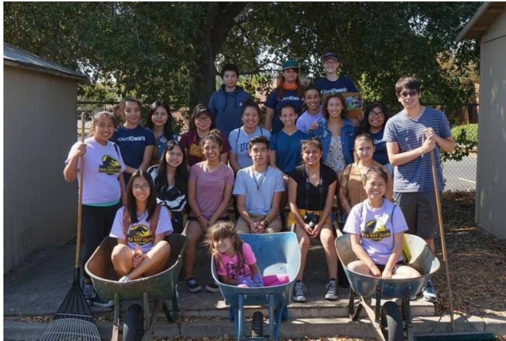
Above: Member of Key Clubs from Region 15 (Divisions 20 and 32) volunteered at our House on Saturday, August 26th.

Is your club planning a project, workday, or fundraiser for the House?